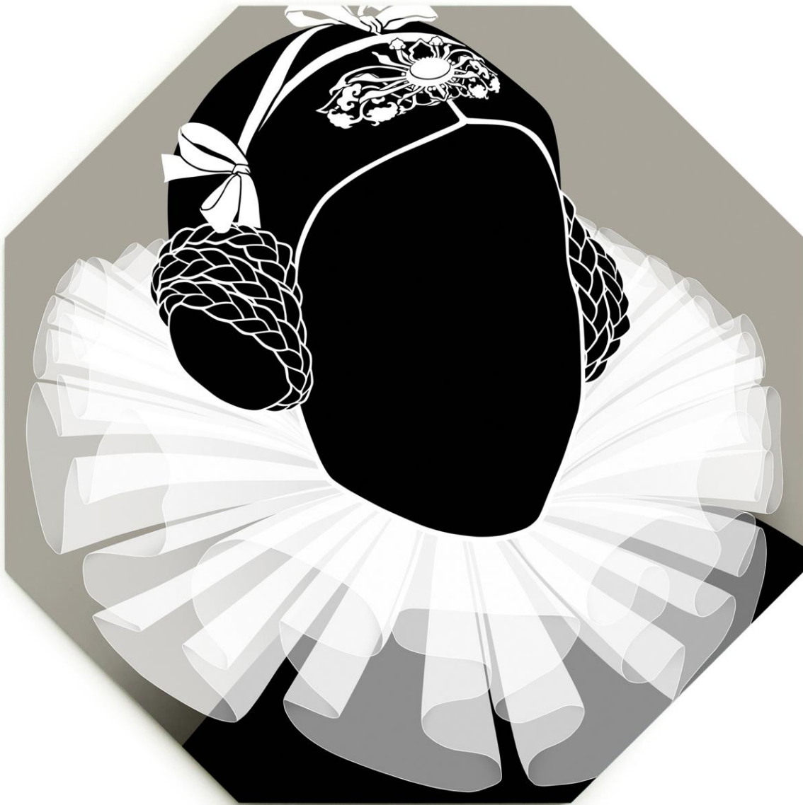
Annysa Ng | St. Dianthus | 2020 | Direct print on Aluminum Dibond | 18 x 18 in. (45.7 x 45.7 cm) (Octagon Shape) Limited edition of 30, signed on verso, includes certificate of authenticity.

These artworks are created digitally and printed directly on Aluminum Dibond. The rendering infused into the metallic medium is delicate yet thoroughly chic and modern.