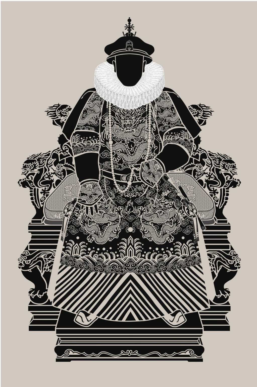
Annsya Ng | Emperor | 2020 | Direct print on Aluminum Dibond* | 60 x 40 in. each | Limited edition of 5

177 East 87 th STREET, SUITE 601, NEW YORK, NY 10128 TEL: (212) 472-9800 www.china2000fineart.com e-mail: c2000fa@aol.com