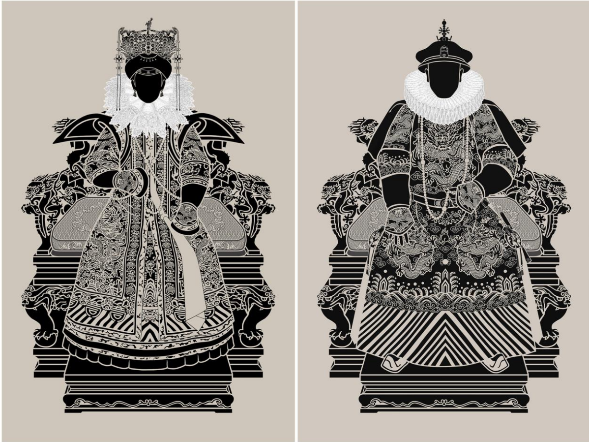
The Imperial Pair & details